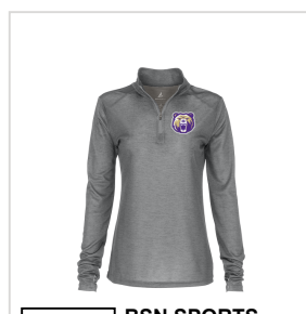
$27.99 BSN SPORTS Women's Velocity 1/4 Zip Pullover