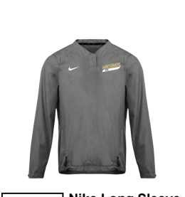
$60.99 Nike Long Sleeve Windshirt